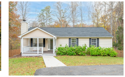
318 Larkspur Rd, Ruckersville - Under Contract, $339,900.