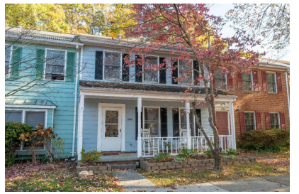
1404 Minor Ridge Ct -Under Contract, $299,000.