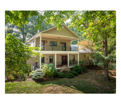
1533 Bennington Dr, Staunton - Under Contract, $615,000.