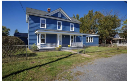
473 N Bath Ave, Waynesboro - Under Contract, $256,000