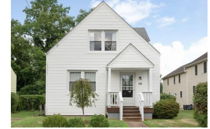
118 Summit St. Charlottesville - Under Contract, $475,000