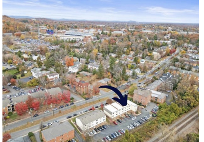
2100 #11 Jefferson Park Ave, Charlottesville - Under Contract, $303,000.