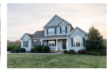
354 Oliver Ridge Ln, Troy - Under Contract, $529,900.